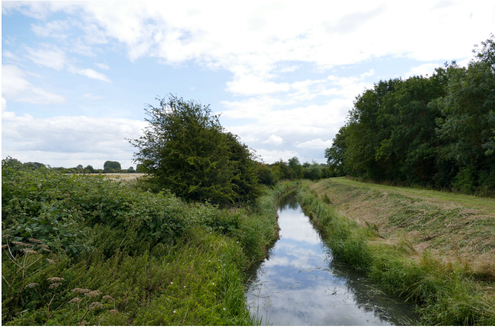
Looking East along the south drain from the Deeping Road