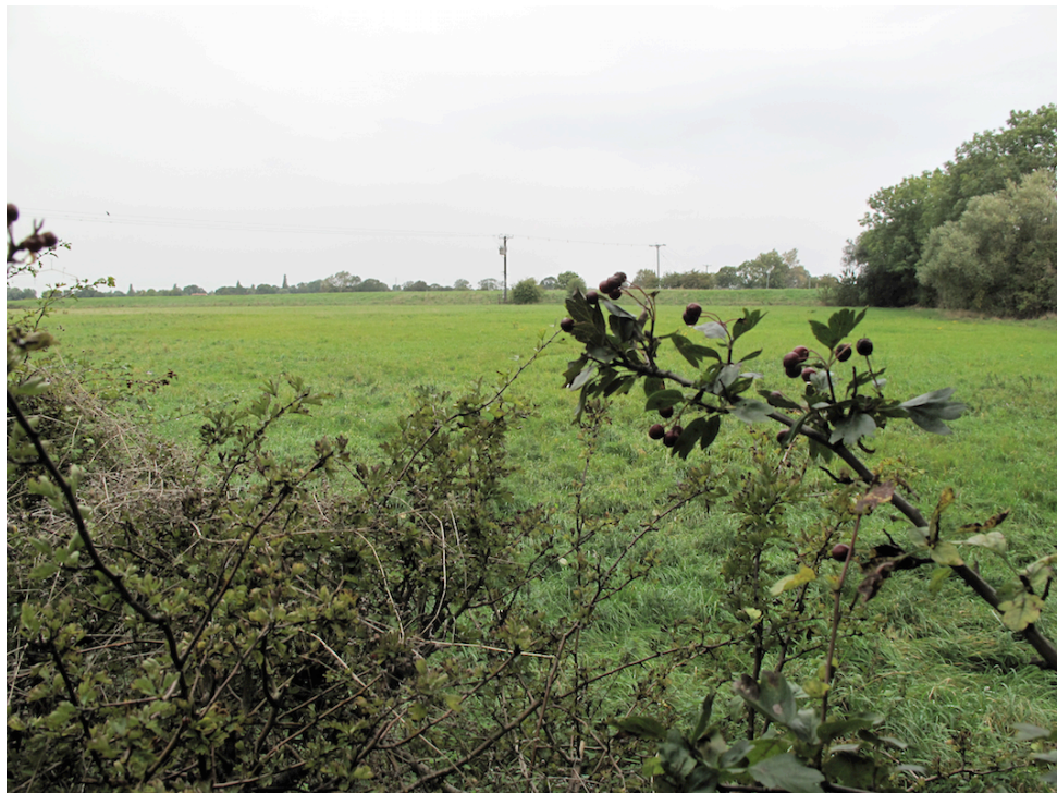
Looking north from the bank of the South Drain towards the Maxey Cut

Conclusion. This is an area of permanent pasture with well defined hedgerows and mature trees. The South Drain is an Environment Agency drainage channel used to help control the level of the water in this part of the Welland Valley.