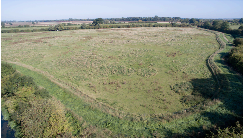
Aerial View of the grass field from the Deeping Road