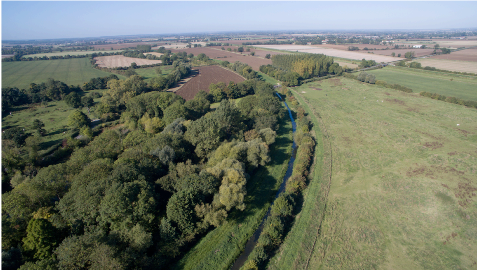
Aerial View looking north west towards Deeping Road.