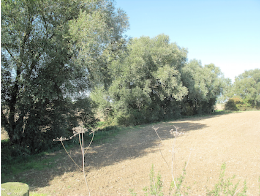
Looking north from the Folly River along the Car Dyke towards the Glinton Road