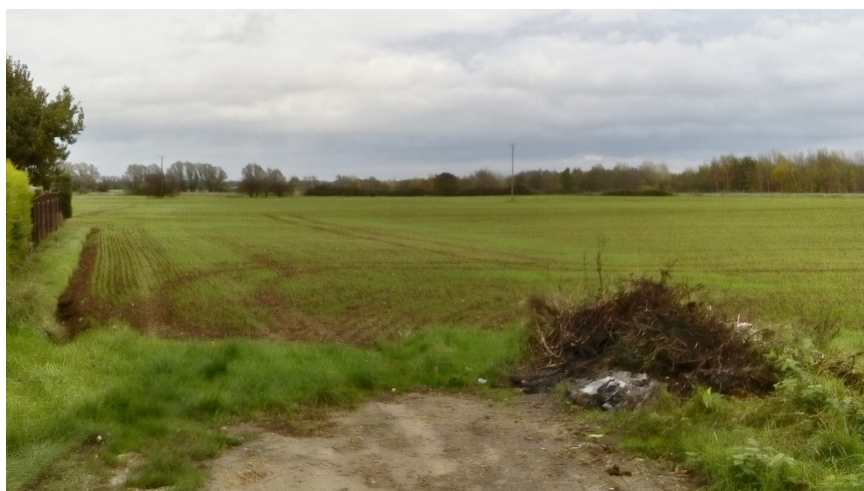
Looking south east from Foxcovert Road towards Werrington parkway.

Conclusion. This is a large arable field on the edge of the village separating Peakirk from the satellite settlement at Foxcovert Rd. It adds to the feeling of openness at the Glington end of the village. The southern corner of the area contains most of the infrastructure and the housing is near the western boundary. The high pressure gas main from the compressor at Waterworks Lane Glington goes through the bottom of this area. Part of it is designated a Green Wedge in the PCC Development Plan Documents.